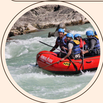
RAFTING IN GANGA