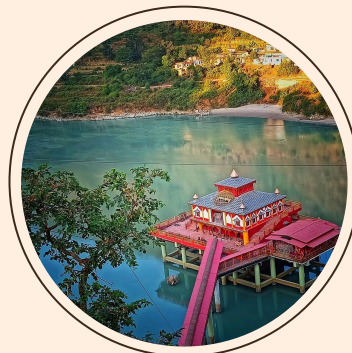
DHARI DEVI TEMPLE

After Dhari you will cross Rudraprayag, Tilwara, Agustmuni, Guptkashi and will finally park your vehicle in Sonprayag . After Sonprayag take a shared taxi till Gaurikund which is 5 kms from there. Your night stay will be in Gaurikund.