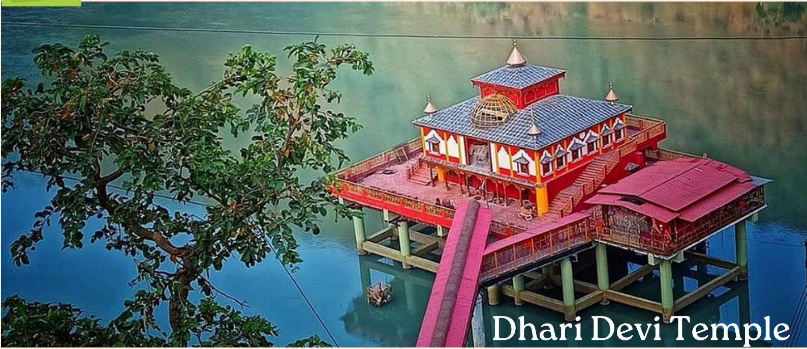
Dhari Devi Temple

START POINT: Rishikesh (ALTITUDE: 390METER)