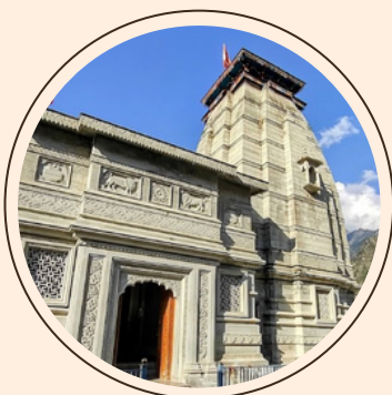
NARSINGH TEMPLE JOSHIMATH

Have your Darshan and go to visit Mana village which has Saraswati river, Bheem Pul, Ganesh Gufa, Byas Gufa and Ghantakaran temple.