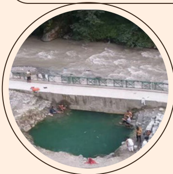
HOT SPRING IN GAURIKUND