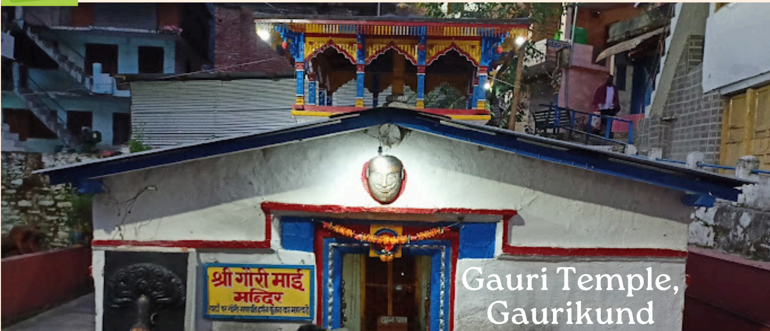
Gauri Temple, Gaurikund

START POINT: Ghasali (ALTITUDE: 1000 METER)