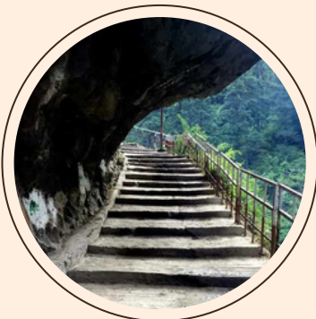
TREK TO YAMUNOTRI