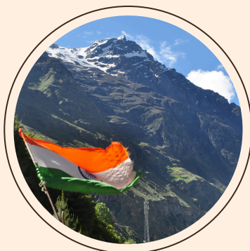
VIEWS FROM MANA VILAGE