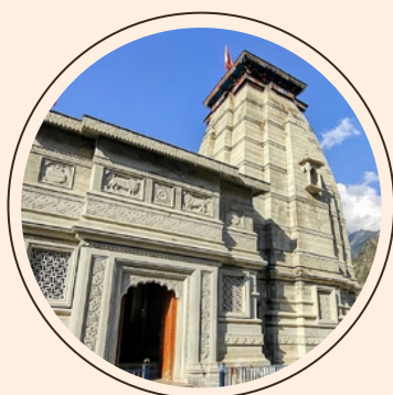
NARSINGH TEMPLE JOSHIMATH

Have your Darshan and go to visit Mana village which has Saraswati river, Bheem Pul, Ganesh Gufa, Byas Gufa and Ghantakaran temple.